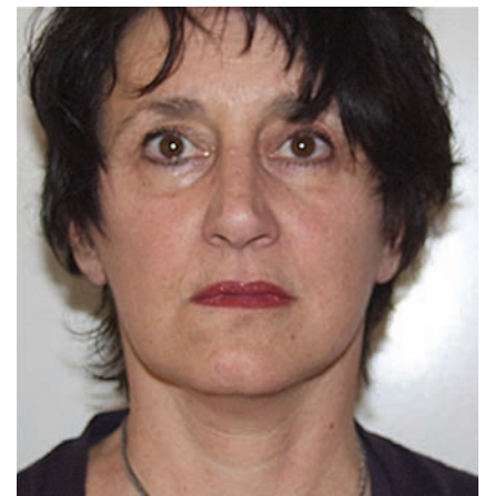
After mini lift

As with any medical procedure, it is always best to schedule a consultation with a reputable physician and discuss all possible risks. (619/296-3223, www.drhilinski.com) – Ann Radcliffe